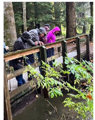
Oct 16 Watching Salmon