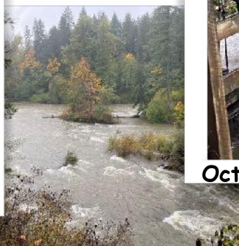
Oct 16 Puntledge in full flow