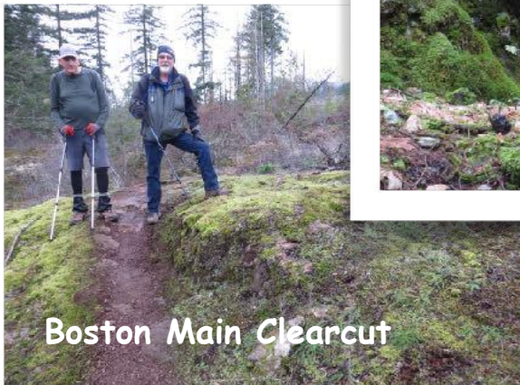
Boston Main Clearcut