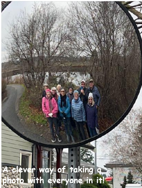
A clever way of taking a photo with everyone in it!