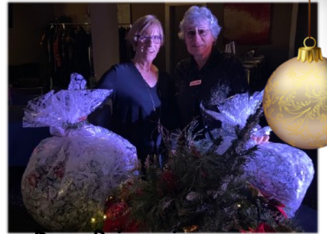
Door Prize winners